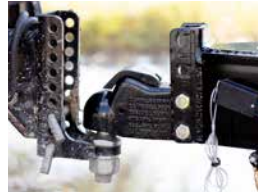
BUMPER PULL 2 5/16"