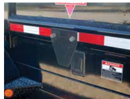
SPARE TIRE MOUNT