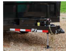
STILLWELL 7K HYDRAULIC JACK