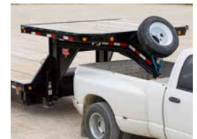
REMOVABLE DECK ON THE NECK