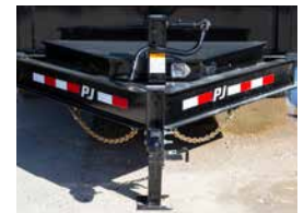
SINGLE 10K JACK