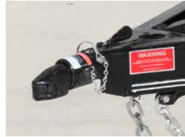
A-FRAME BUMPER PULL 2" - 2 5/8"