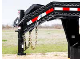
GOOSENECK 2 5/16"