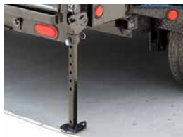
REAR SUPPORT STANDS