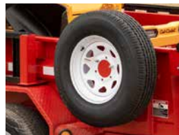
SPARE TIRE AND MOUNT