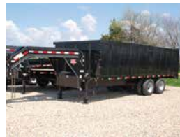
3', 4' & 6' REMOVABLE SIDES (DD DUMP ONLY)