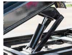
6" SCISSOR LIFT CYLINDER

SOME OPTIONS NOT SHOWN, PLEASE VIEW PRODUCT PAGE FOR A LIST OF ALL OPTIONS