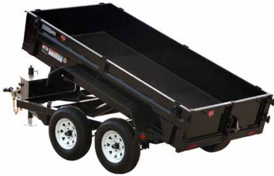
Tandem Axle Option Shown (Single Axle Standard)