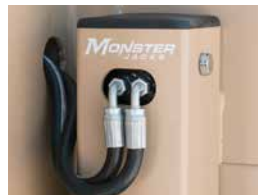
HYDRAULIC MONSTER JACKS