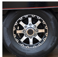
TWO TONE ALUMINUM